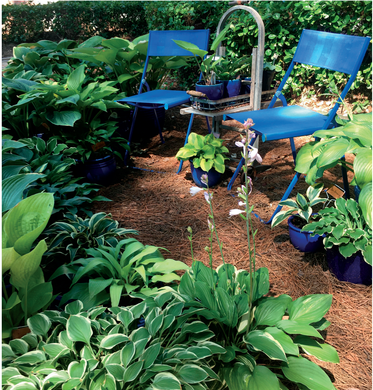
Blue chairs and a antique hose-reel table are tucked into a hosta nook.

Similar confines seemed like the perfect fit with a 7-foot stand of Hosta 'Royal Standard' at the front door. Contrary to my thrifty Scottish background and do-it-yourself attitude, we hired help and survived the move, though a twisted ankle and hernia for two octogenarians slowed progress. Meanwhile, the promise of a new patio garden out back waited patiently.