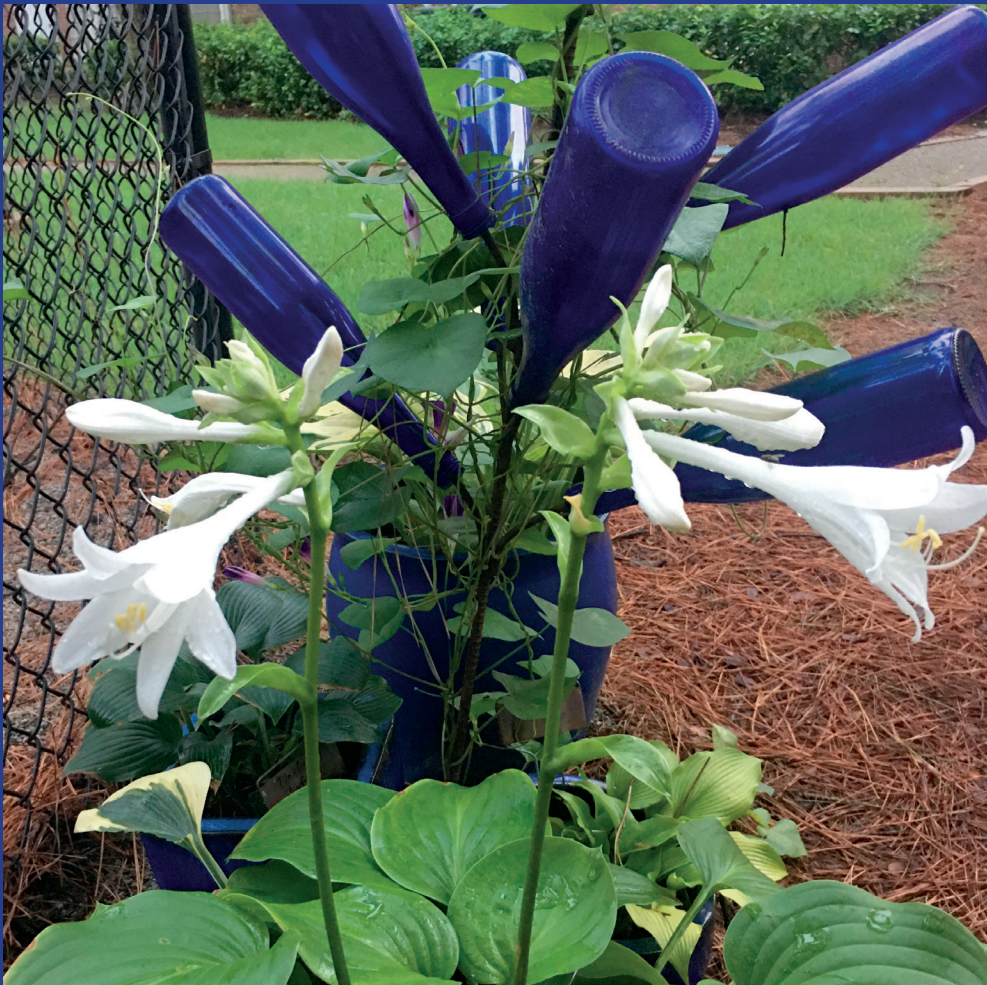
H. 'Aphrodite' flaunts fragrant flowers in an extended bloom period.