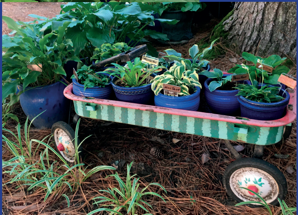
Shari's watermelon-painted wagon is ready to roll with minis.